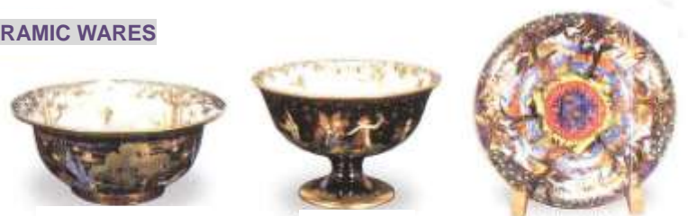
K'ang Hsi Bowl 2439 Melba Cup Lily Tray 2483