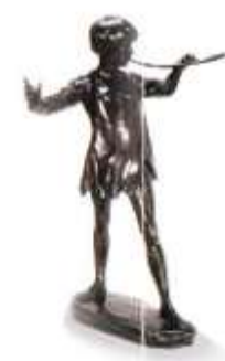
Statue of Peter Pan