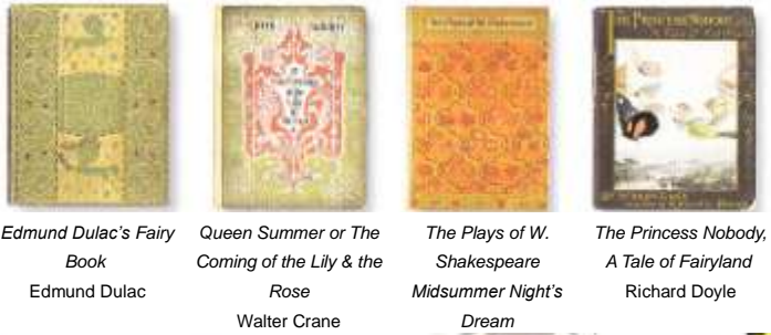
Edmund Dulac's Fairy Book Edmund Dulac Queen Summer or The Coming of the Lily & the Rose Walter Crane The Plays of W. Shakespeare Midsummer Night's Dream The Princess Nobody, A Tale of Fairyland Richard Doyle

Beautiful illustrated books are exhibited in the fairy art salon.