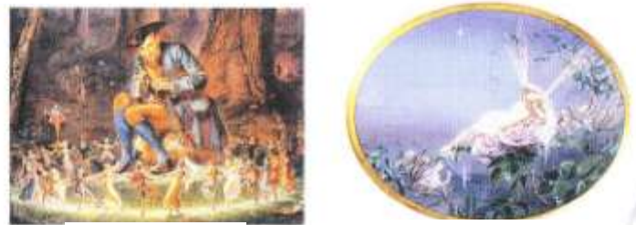
The Bewitched Piper Titania Resting on the Flowers